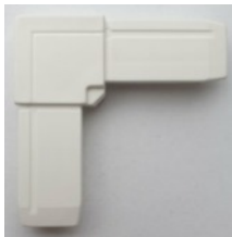
4 corner pieces

Each fly screen kit contains the following items which will build 1 complete fly screen