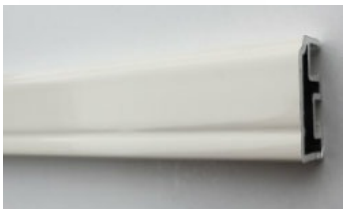
4 sections of Aluminium framing cut to size