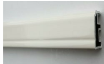
4 sections of Aluminium framing cut to size