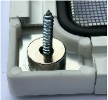
4 magnets and screws