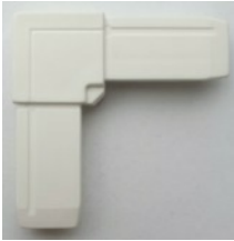
4 corner pieces

Each fly screen kit contains the following items which will build 1 complete fly screen